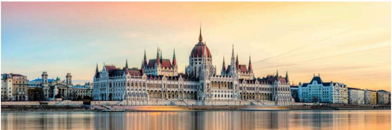
Budapest – view of the Danube and Hungarian Parliament

Budapest, Hungary's vibrant capital, beautifully merges its rich history with modernity. Situated along the scenic Danube River, Budapest is known for its stunning architecture, cultural heritage, and lively atmosphere. It is the tenth-largest city in the EU by population within city limits and the second-largest city on the Danube River.