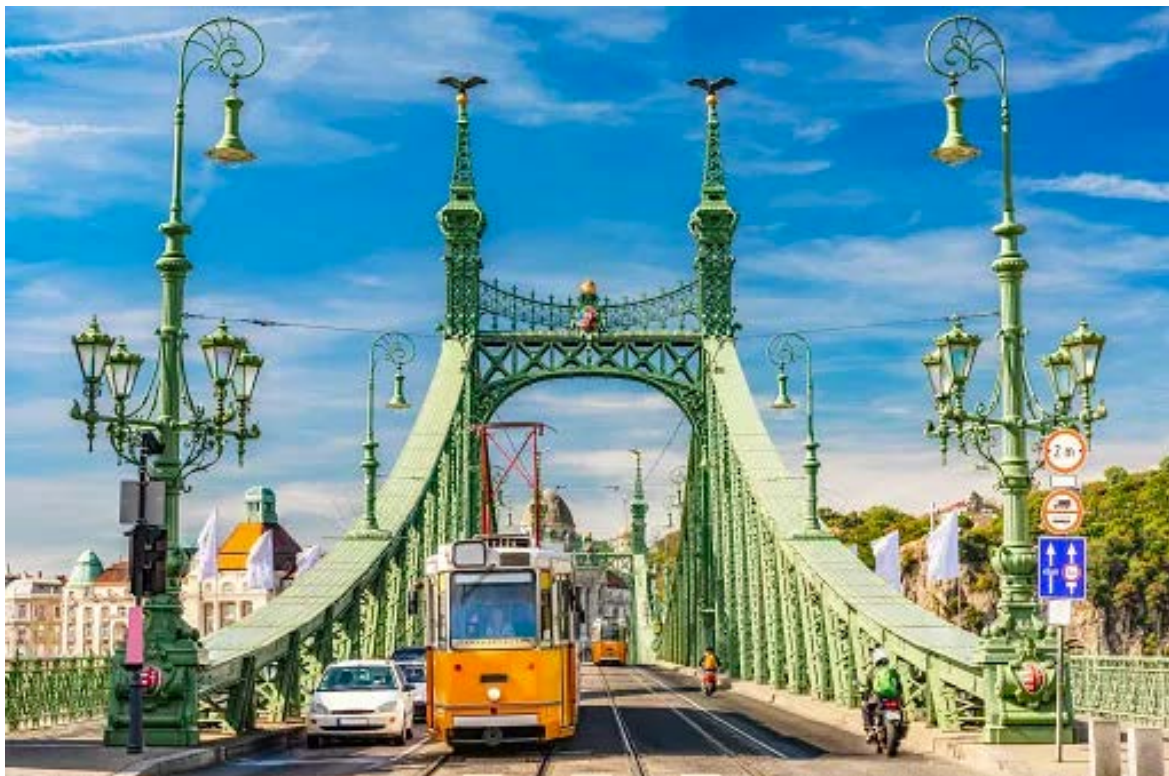
Iconic yellow Budapest tram