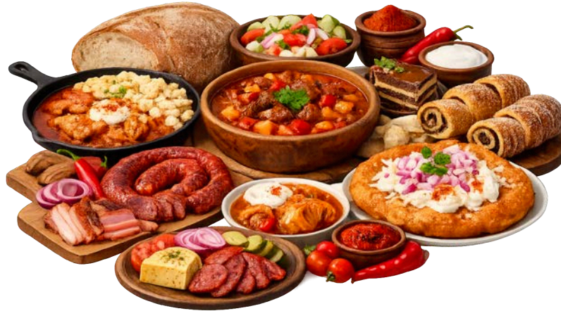
Traditional Hungarian cuisine

Budapest is a gastronomic hub offering both traditional Hungarian cuisine and international dining. Some must-try dishes include: