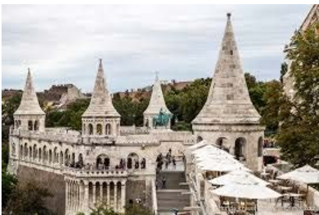
Buda Castle & Castle