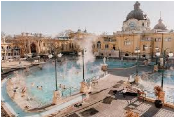
Széchenyi Thermal Bath