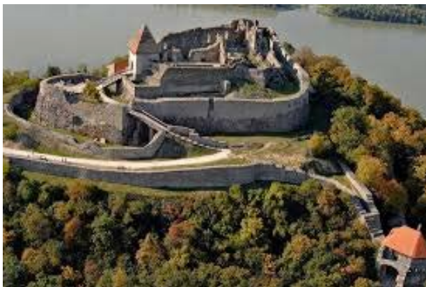
Visegrád & Danube view