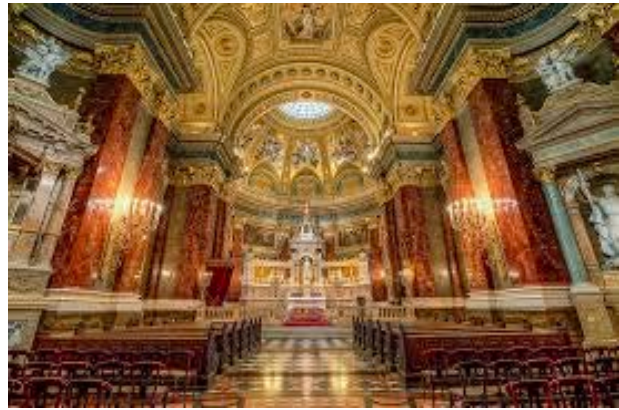
St. Stephen's Basilica