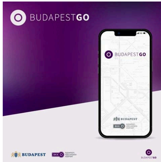
BudapestGO – the official BKK app

The BudapestGO app provides ticket purchase, journey planning, and real-time traffic information in one easy-to-use application. Benefits include: