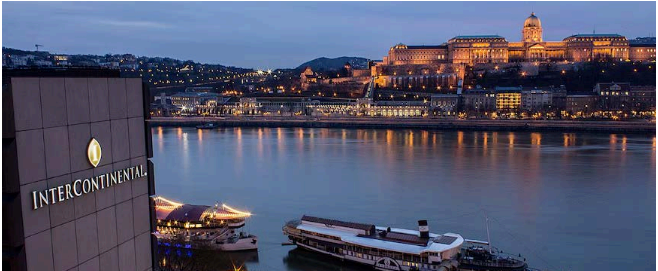
InterContinental Budapest Hotel by IHG

The InterContinental Budapest Hotel by IHG will be the main venue for the 2026 IEEE International Leadership Conference. Situated right on the banks of the Danube River, this hotel is centrally located and offers spectacular views of the river and the Buda Castle. The hotel is within walking distance of many of Budapest's most iconic landmarks.