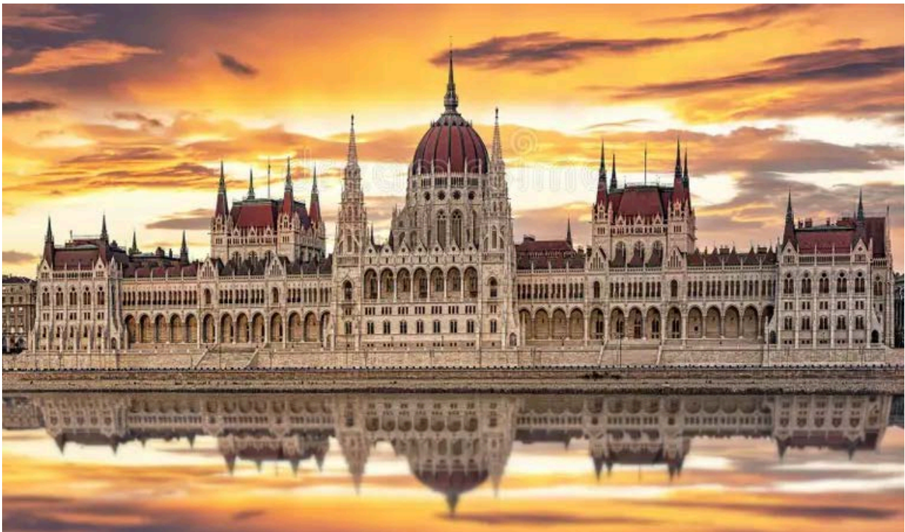
Hungarian Parliament Building

Many of Budapest's major attractions, including St. Stephen's Basilica, Váci Street (for shopping) and Fisherman's Bastion are within walking distance of the hotel. The Parliament Building and Buda Castle are just across the river, easily reached by a pleasant walk or a short tram ride.