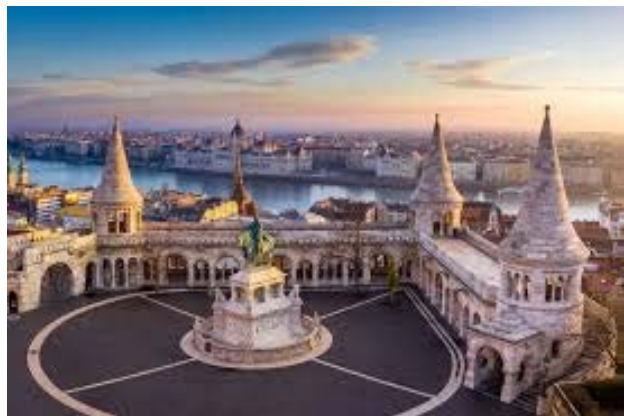
Hill Fisherman's Bastion